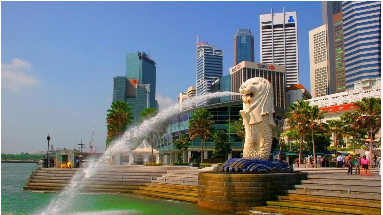
The skyline of Singapore, which Oxfam has found to be the fifth worst corporate tax haven in the world.